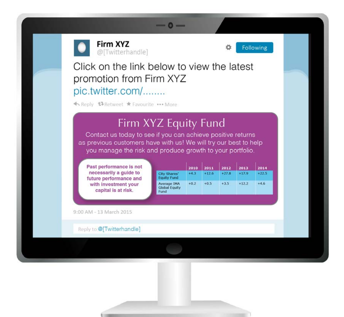
Figure 5: Investment inserted images example.