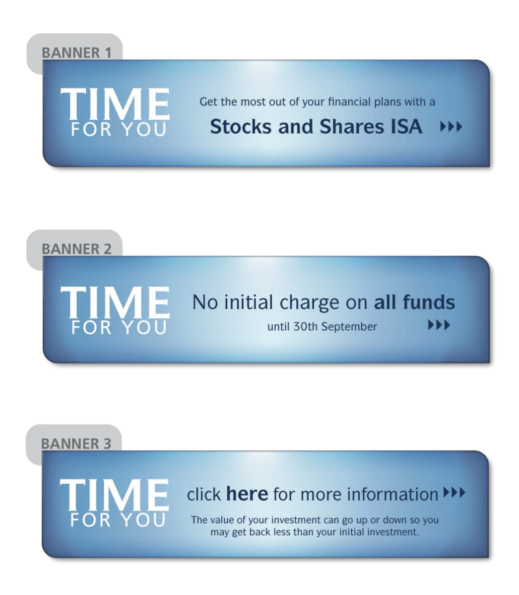
Figure 4: Example of a compliant banner promotion. The risk warning is clear in the last frame of a dynamic banner

<sup>6</sup> www.fsa.gov.uk/pages/doing/regulated/promo/pdf/compliance.pdf