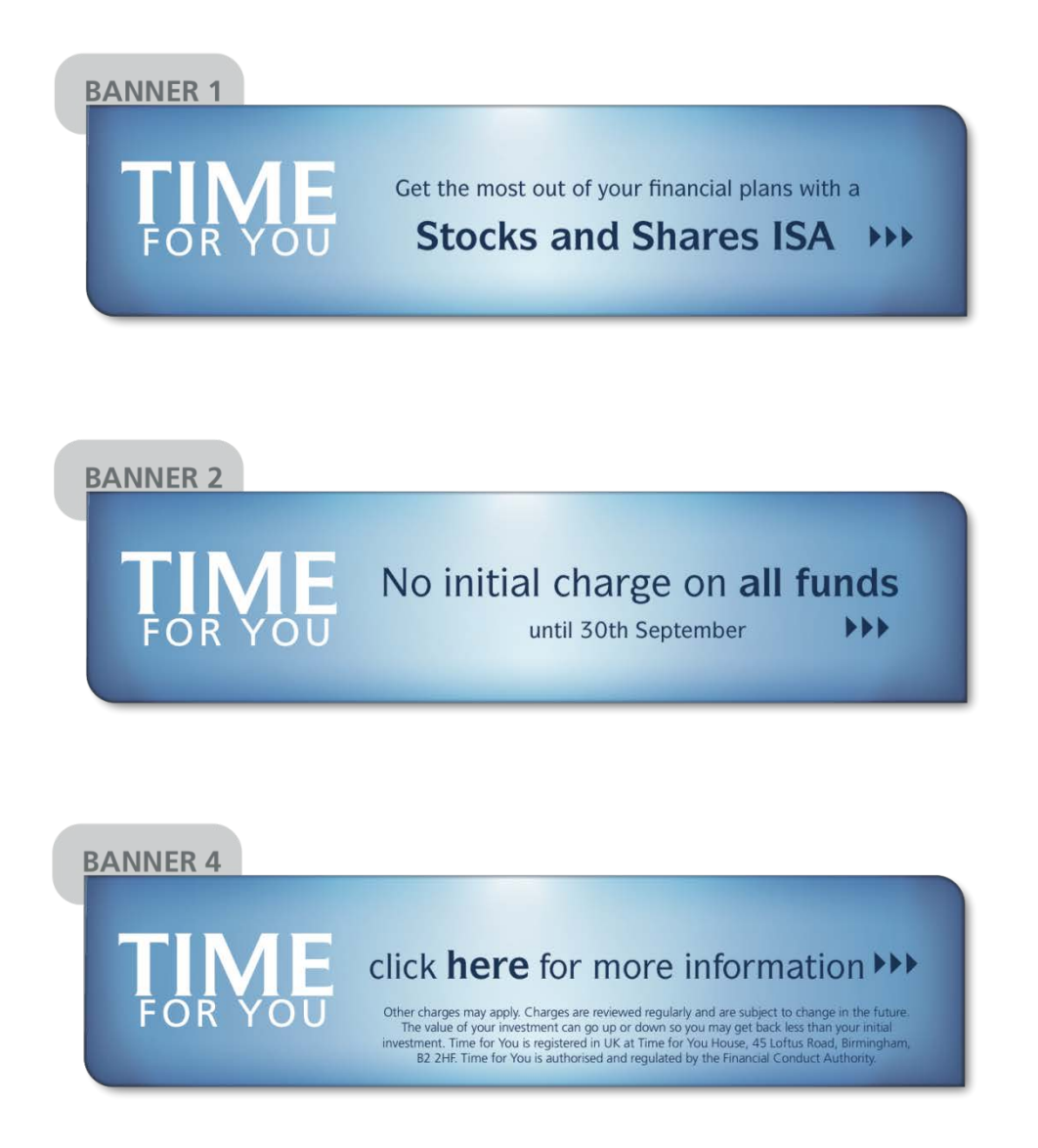
Figure 4a: Example of a non-compliant banner promotion. The risk warning is lost in surrounding text, which is also of much smaller font-size